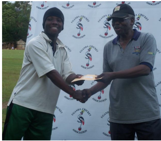
L-R: Best wicket keeper and bowler are awarded.