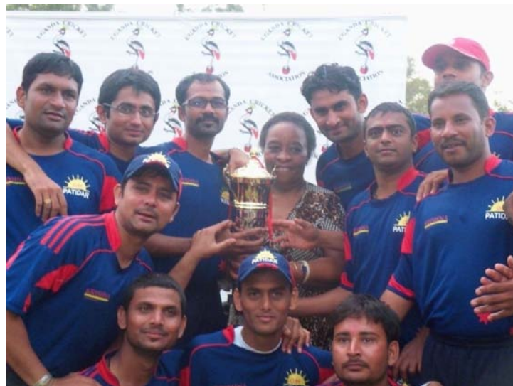
The Winners of the T20 Tournament, Partidar Samaj are crowned Champions.