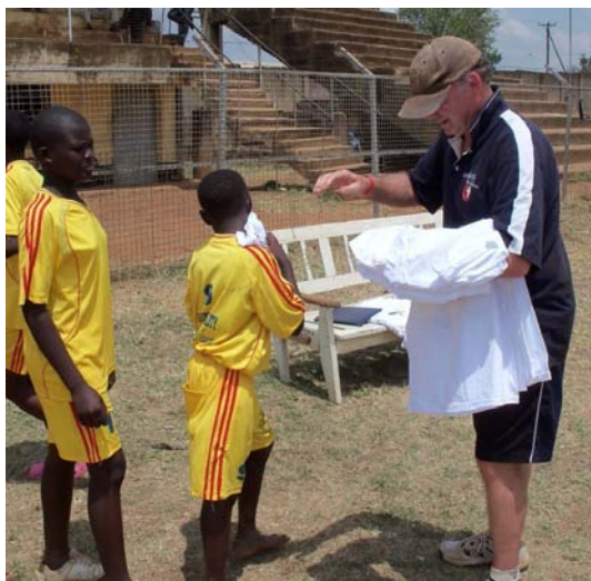
Distribution of T shirts in Mbale District

L: A member bowls during practice R: Members perform a warm up drill.