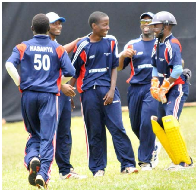
Nile CC members celebrate a fall of a wicket in the final A Wanderers player dispatches one for six in the semi final against Nile CC