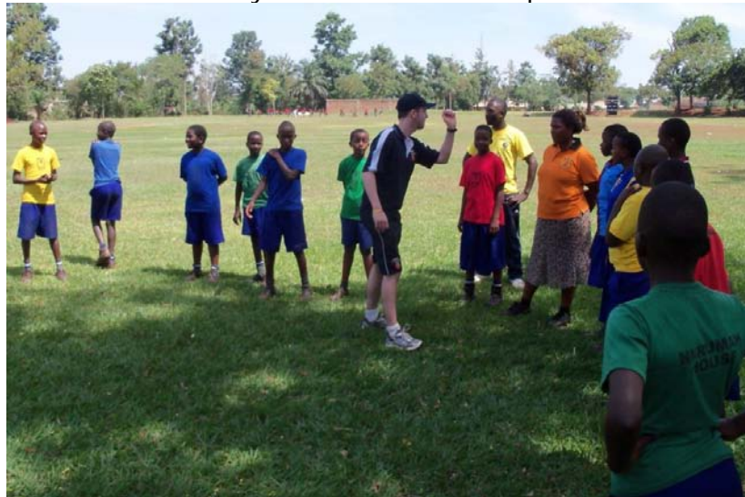
Coaching in Jinja District

The Cricket Without Boundaries Tour team from England arrived in Uganda at the end of February to carry out coaching visits in the various Districts. Coaching was carried out in Western, Central and Eastern Districts. Coaching and Administrative Courses were also carried out in some Districts. Their visit caused a lot of excitement in the regions visited and Uganda Cricket Association will ride on this visit to spread the game further to other areas. The members also distributed equipment to the Uganda Cricket Association among other activities. Gratitude goes to the team of seven for the awareness created in the areas they visited. Below is the pictorial for some of the areas visited.