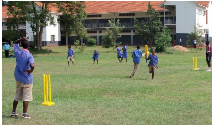
Minicricket competitions in Jinja District

The MTN/Stanbic Mini cricket Development program co-sponsored by MTN Uganda and Stanbic Bank kicked off on 10th March 2011 in some Districts. The tournament comes to a climax with the National Finals at Lugogo and Kyambogo Cricket Ovals on 24th & 25th June 2011. There was a lot of excitement created by the plastic equipment purchased from South Africa. The tournament which was originally played using wooden equipment will now be played with colorful plastic equipment. Below is the pictorial from some of the District competitions.