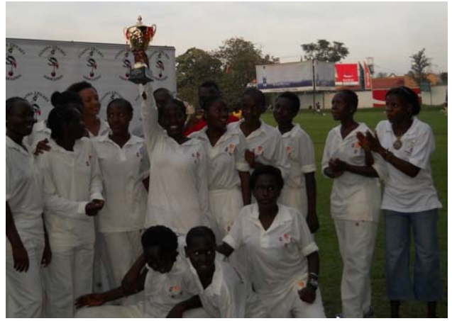
Above: Part of the crowd that turned up for the final at Lugogo Cricket Oval Gayaza High School players celebrates with the winner's trophy