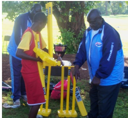
L: Jinja Girls players celebrate after lifting the winner's trophy. R: Equipment being distributed to the Schools.

The 2011 Girls Schools Cricket Week Tournament kicked off on 17 th April 2011 at Lugogo, Kyambogo, Kings College Budo and Gayaza Cricket Ovals. 12 schools from three regions participated in the tournament, an increment of 2 from last year. Soroti Light College and Gayaza High School made it to the thrilling final with the latter winning by 36 runs. The tournament was used to identify talent which will come in handy as Uganda prepares for the East Africa Under 19 Girls Tournament later this year. Below is the pictorial from the tournament.