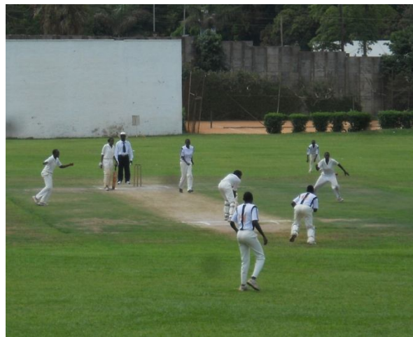
Above: Action in the final at Lugogo Cricket Oval