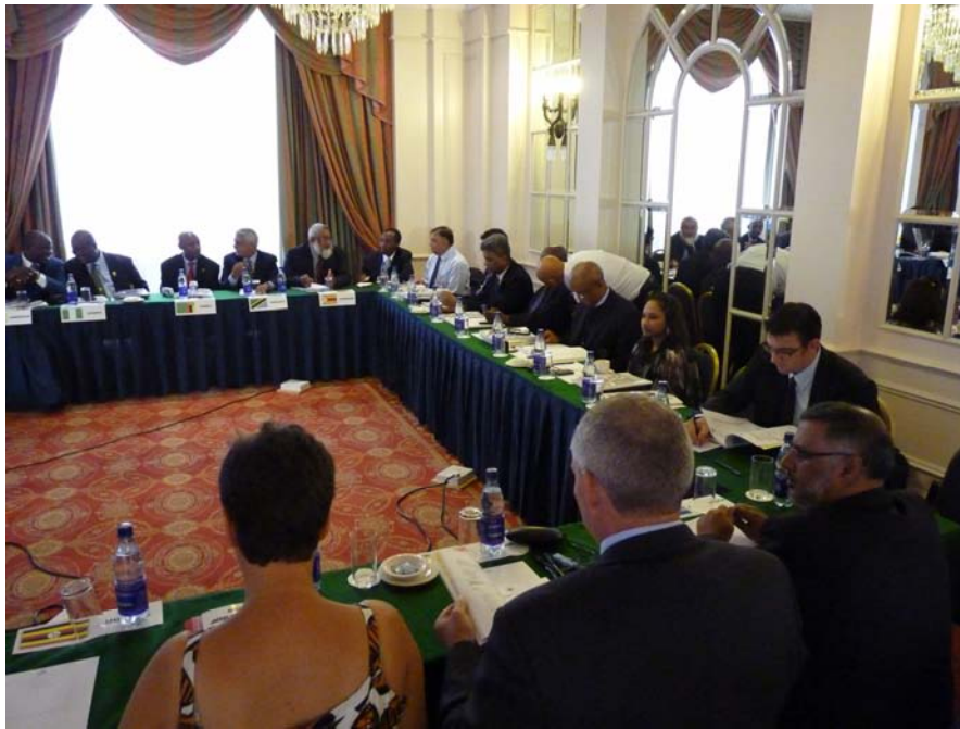
Above: Delegates present at the ACA AGM